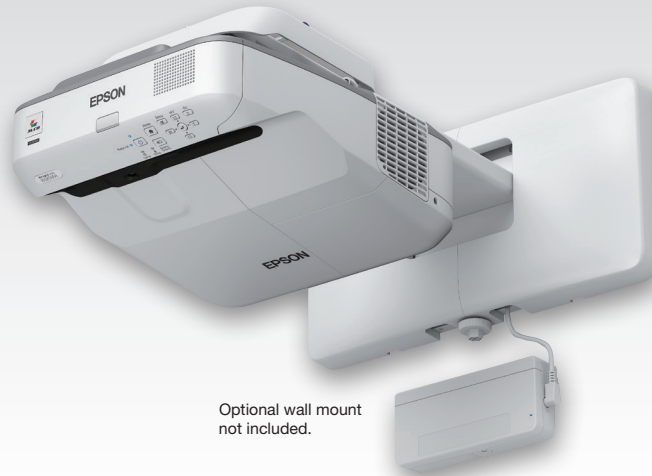
Optional wall mount not included.